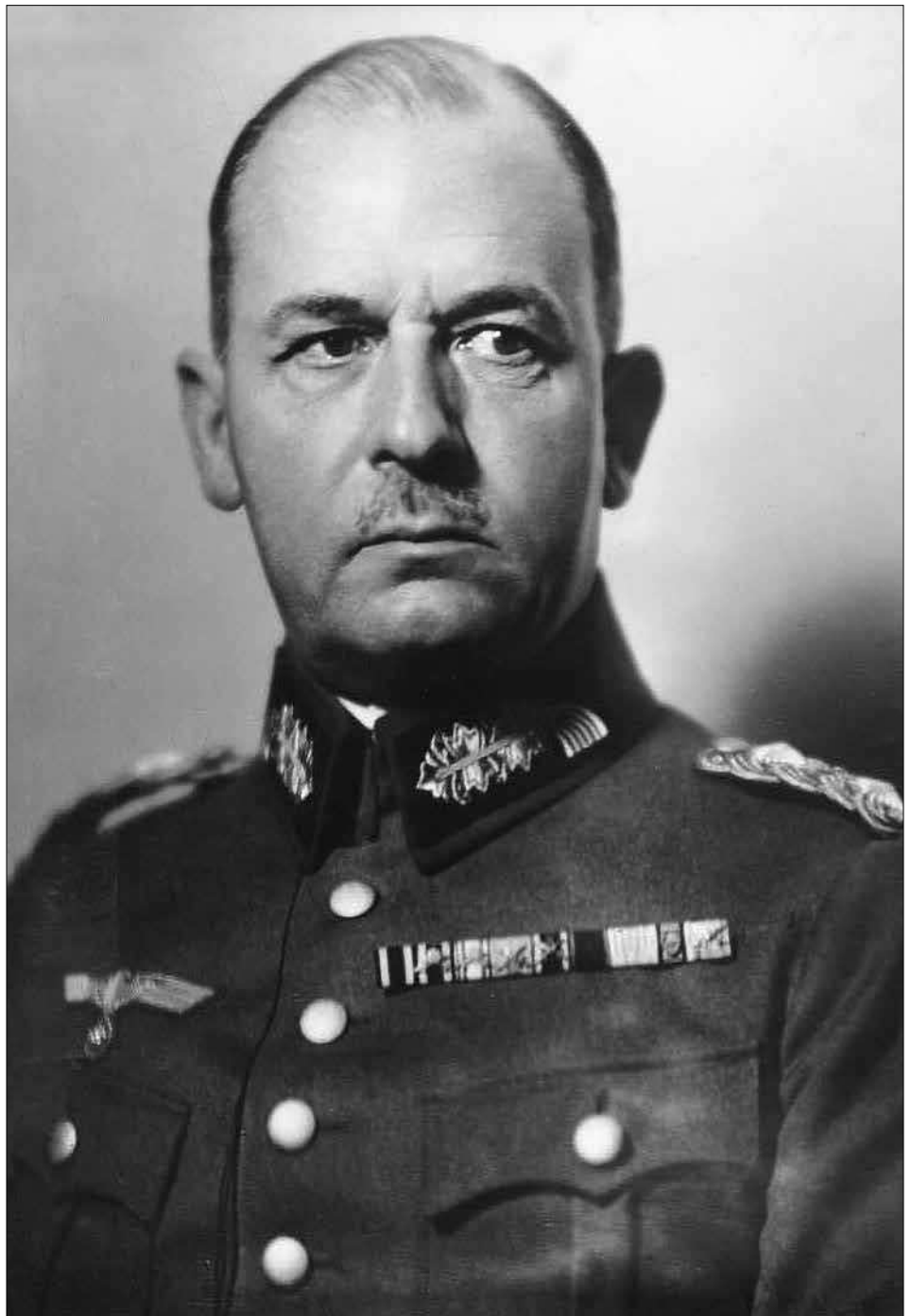
A panel of American judges convicted Field Marshal Wilhelm List for war crimes on a theory of command responsibility.

Although the United States has not ratified AP I or the Rome Statute, it accepts the command-responsibility provision in AP I as reflective of CIL. 51 Customary international law is consistent practice that states follow out of "a sense of legal obligation." 52 According to CIL, then, commanders may be responsible for failing to prevent war crimes which they knew or had reason to know their subordinates would commit. 53