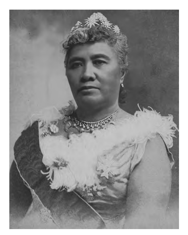
Fig. 21.2 Queen Lili'okalani, Constitutional Executive Monarch, 1891–1917. (Unknown Artist) (Public Domain)

officials and ten persons elected by the corporation's shareholders. According to Henry Witney: "Native Hawaiians are admitted free of charge, while foreigners pay from seventy-five cents to two dollars a day, according to accommodations and attendance."<sup>53</sup> It wasn't until the mid-twentieth century that the Nordic countries did what the Hawaiian Kingdom had done with universal health care.