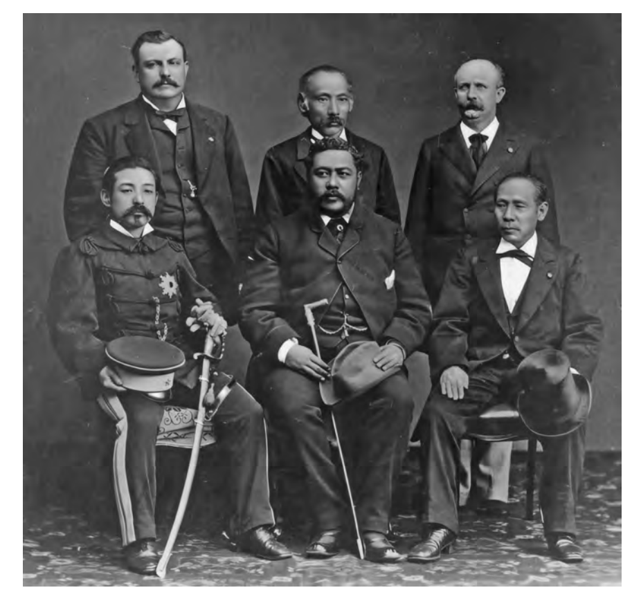
Fig. 21.3 King Kalākaua with officials of the Empire of Japan, 1881. (Top row L–R) Hawaiian Colonel Charles Hastings Judd, Japanese state official Tokunō Ryōsuke, and William N. Armstrong, Kalākaua's aide; (bottom row L–R) Prince Komatsu Akihito, King Kalākaua, and Japanese Minister of Finance Sano Tsunetami.

ten months and take the Hawaiian king to Japan, China, Hong Kong, Siam (Thailand), Singapore, Johor (now in Malaysia), India, the Suez Canal, Egypt, Italy, France, Great Britain, Scotland, Belgium, Germany, Austria, Spain, and Portugal (Fig. 21.3). All graciously received the King and he exchanged royal orders with these countries.<sup>60</sup> After he returned home, Kalākaua also exchanged royal orders with Naser al-Din Shah of Persia.<sup>61</sup>