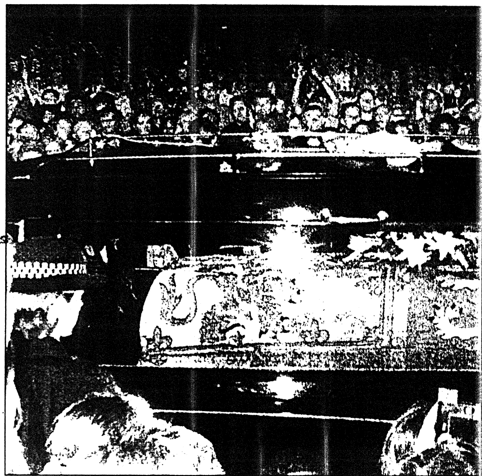
The hearse carrying the Princess of Wales' coffin travels toward Kensington Palace in prepara-