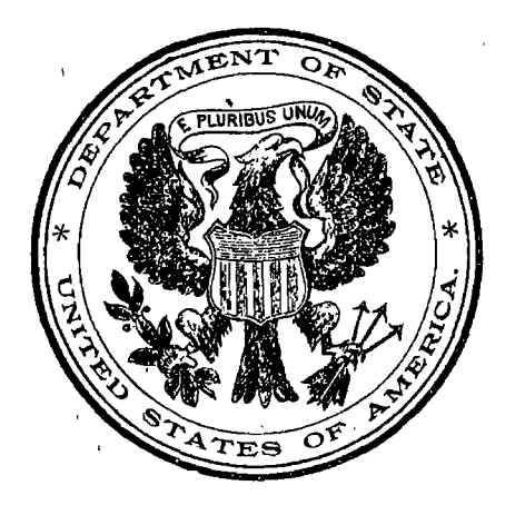
WASHINGTON GOVERNMENT PRINTING OFFICE 1895